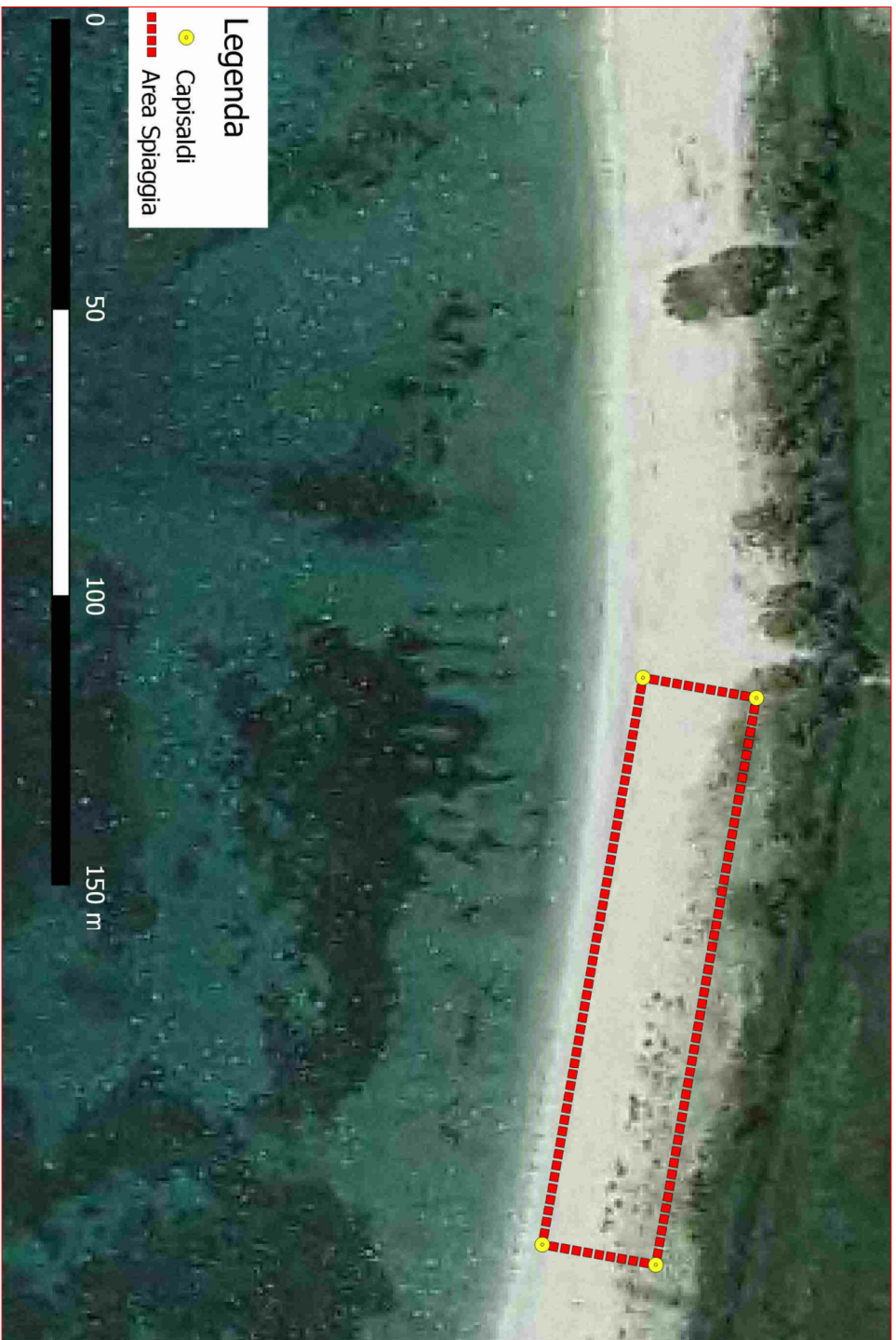
Ortofoto R.A.S. 2003